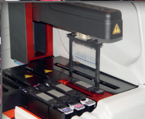
Automated Gel reader