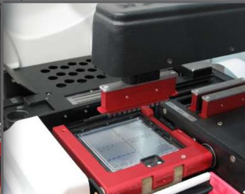
Automated sample application